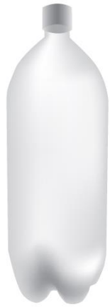
Empty plastic bottle with cap